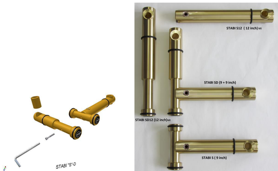
Fug. 8 Second tonearm SD kit

Adding second tonearm adaptor or 12 inch version tonearm adaptors are available.