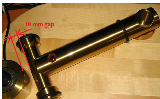
Fig. 6. Position T base + motor tower

Remove the foam and lift the main T base ( Fig. 2) of turntable carefully as it is heavy and put it on a shelf so that the side with the bearing is situated at 8 o' clock and the side with the tonearm mount at 2' o clock. See Fig 6.