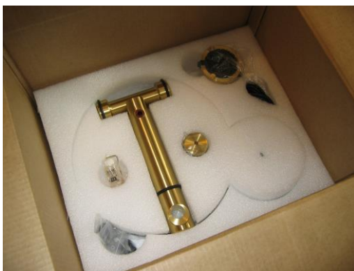
Fig. 2. T base and parts