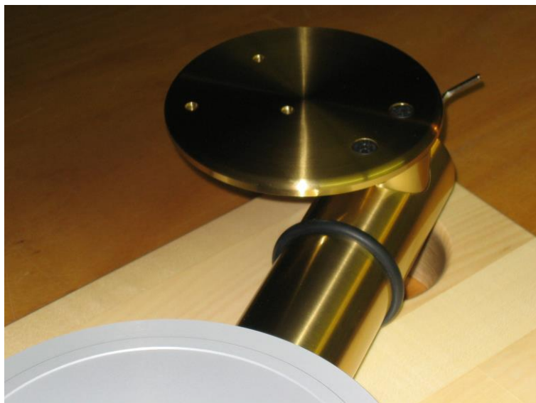
Fig. 7. Circular brass armbase ( available various cut outs)

Remove the brass pillar and find underneath two threaded holes. Find the circular brass armbase (optional) with appropriate cutout. Using Allen key (3 mm) and two screws fit this onto the pillar. Insert back into T base and, with tonearm protractor, position the brass plate correctly by rotating the brass pillar while releasing the VTA screw with Allen key (3mm). See fig. 7. Follow tonearm mounting instructions. It is possible that in some circumstances the lid provided may not fit .