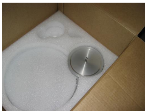
Fig. 3. Subplatter