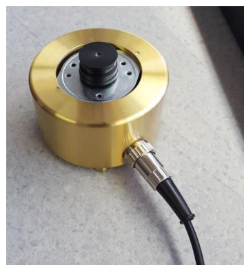
Fig. 6A. 5pin DIN motor cable