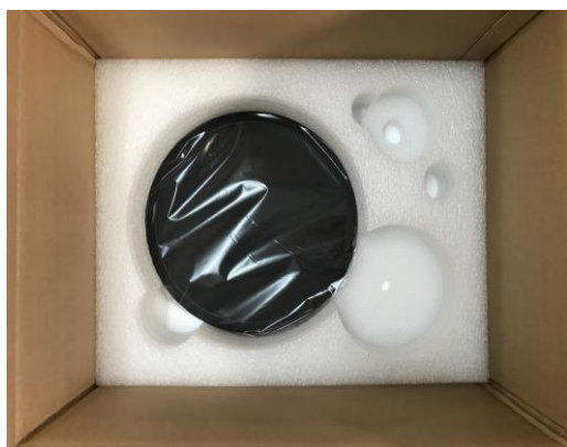
Fig. 4. Platter