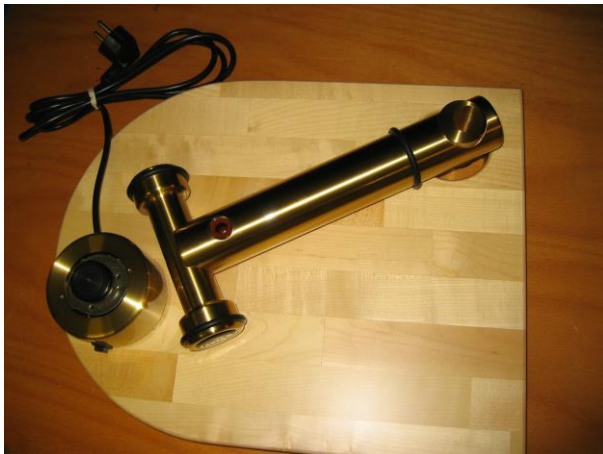
Fig. 6 Position T base + motor tower

Remove the foam and lift the main T base ( Fig. 3) of turntable carefully as it is heavy and put it on a shelf so that the side with the bearing is situated at 8 o' clock and the side with the tonearm mount at 2' o clock. See Fig 6.