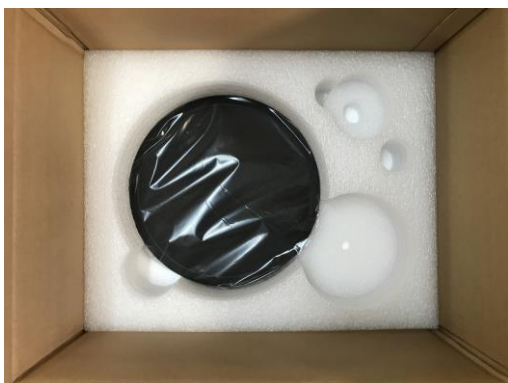
Fig. 5 Unpacking: platter