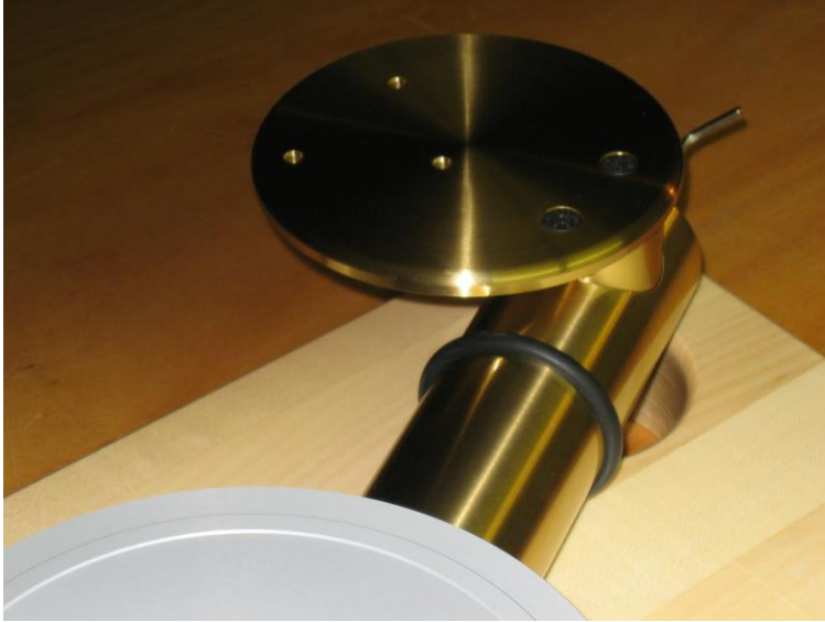
Fig. 7 Circular brass armbase