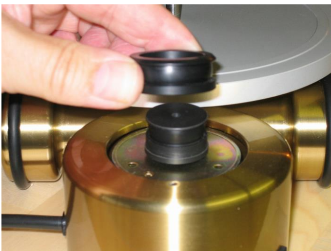
Fig. 8 45 rpm crown ring adaptor ( no PS)

The pulley fitted is for 33 rpm. Find the black plastic crown pulley ring which fits over the existing motor pulley increasing the diameter of the motor pulley and bringing the speed up to 45 rpm. To do this the platter must first be removed and, with clean fingers, stretch the belt away from the motor pulley while, with the other hand, pushing down crown pulley ring. Make sure the thicker ridge goes down. See Fig. 8. Return platter. To remove the crown pulley reverse the procedure.