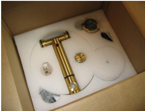
Fig. 3 Unpacking: T base and parts .