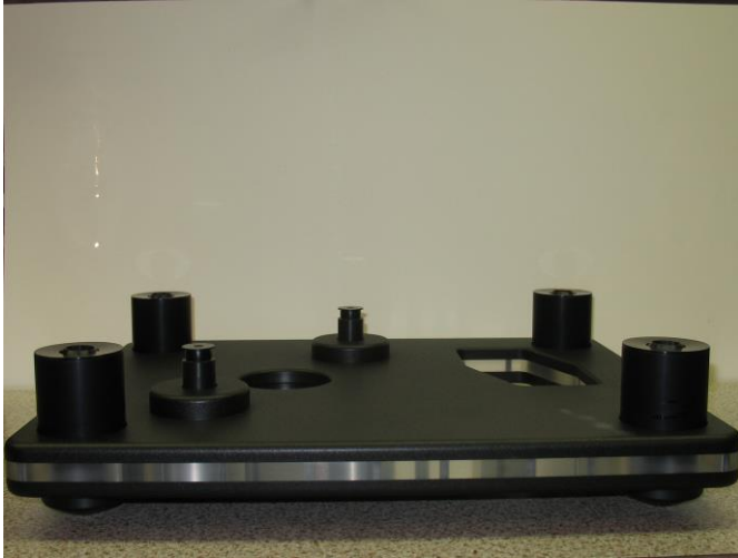
Fig. 2 Base chassis