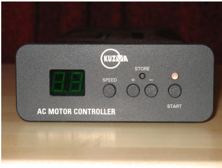
Fig. 6. Front panel