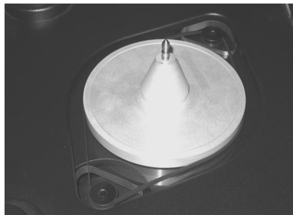
Fig. 5 Belt position

Test suspension: The subchassis should move a few mm in all directions if gently pushed and then return to its original position.