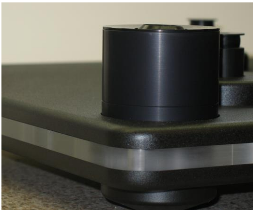
Fig. 4 Height of the lower edge of the top chassis

The best way to do this is to adjust two opposing knobs a little, then another two knobs a little and the first pair again, etc. At this stage do not be too precise as the armboard and tonearm have yet to be added and they will lower the subchassis height.