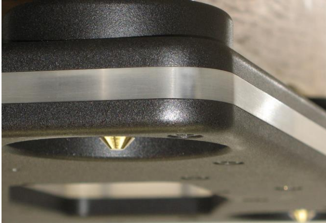
Fig. 7 Silver spike